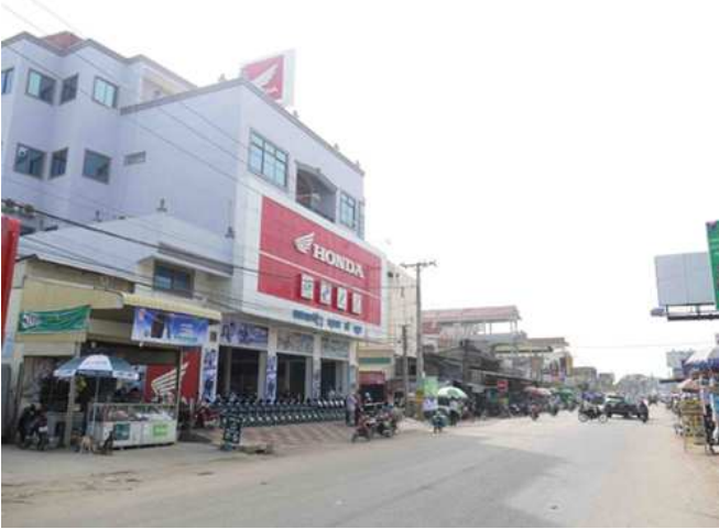
HONDA POR LENG Dealer Shop