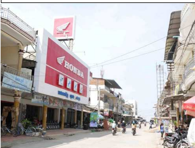
HONDA HENG OUN Dealer Store