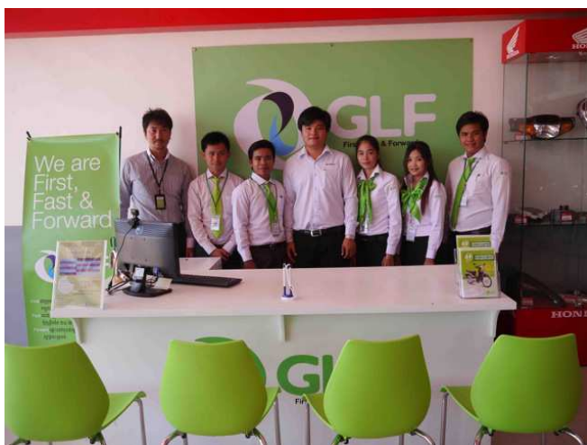
Owner of HONDA SEANGRANET & GLF Staffs