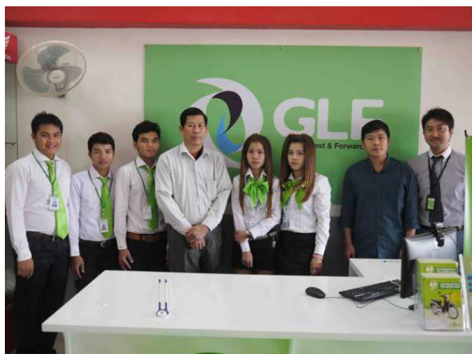
Owner of HONDA SENG HOUT & GLF Staffs