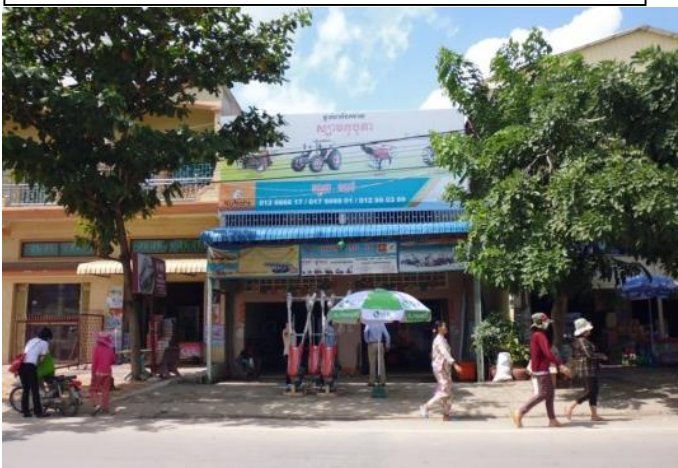
KUBOTA dealer HUOT PEOV