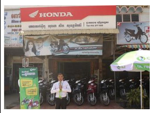
HONDA Buoy Ly