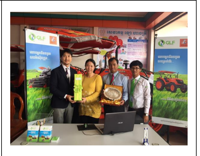
Operating Regions of GLF Agricultural Machines after Establishment of KUBOTA LOR HANGKRY