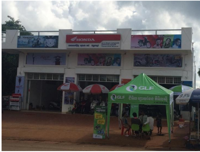
GLF's regional sales office map after establishment of new sales