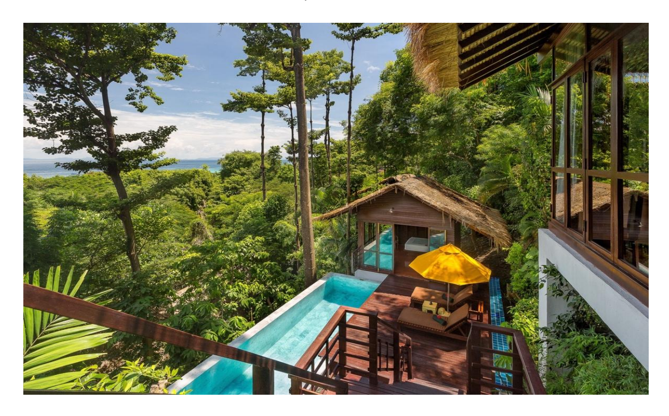
Why did you decide to convert Zeavola into an eco-friendly resort?

Resort, and he is now in his 11th year there. Zeavola Resort is based on a traditional southern Thai village and the tag-line is "Back to Simplicity", while providing barefoot luxury with personalised service. The hotel is rated number one on Tripadvisor on Phi Phi Island!