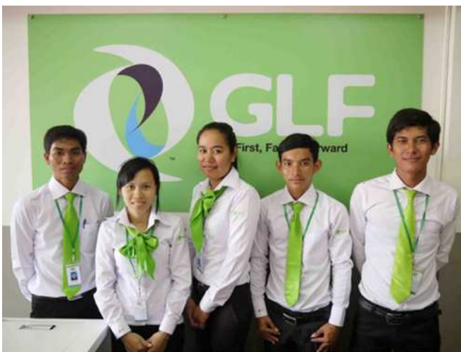
GLF Staffs at HONDA LIN SREY