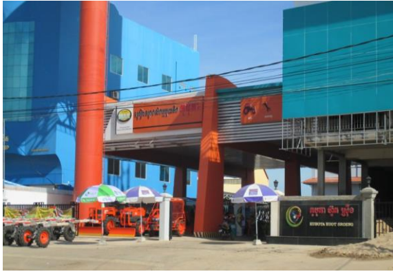
KUBOTA HUOT SROENG