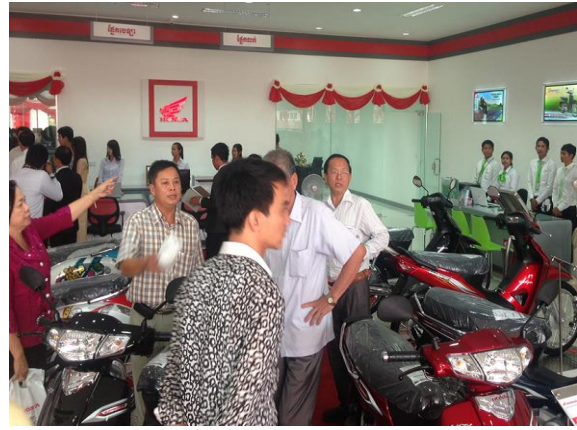
Operating Regions after Establishment of New Sales Office