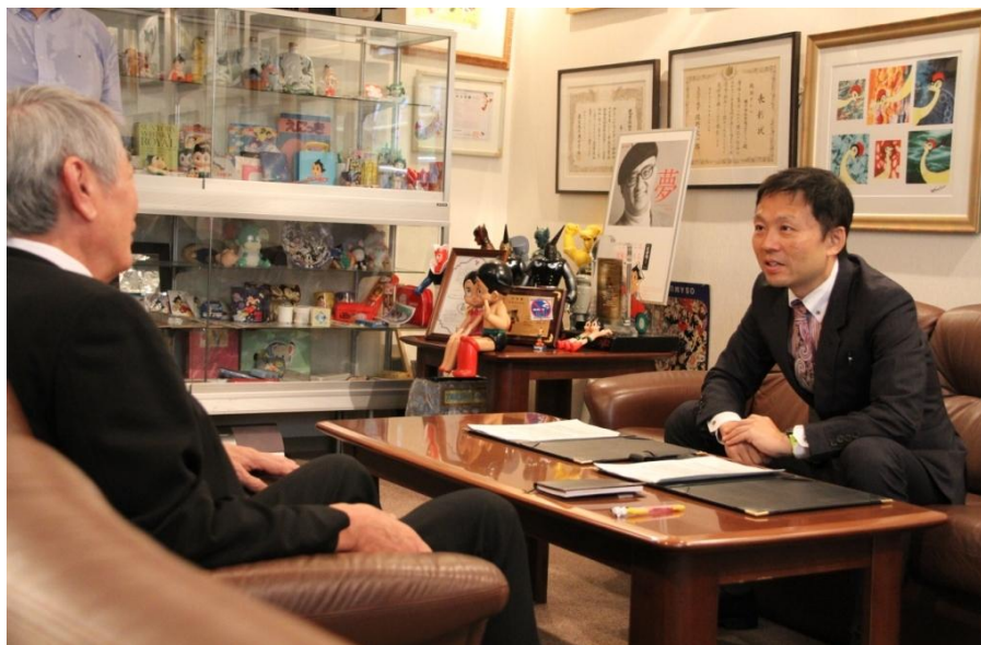
Signing at the office of TEZUKA Production co.,ltd.

with Tezuka production as one step, we aim to boost an entertainment field by making Asian users feel thrills and spills with digital, and become a bridge between contents holders and users.